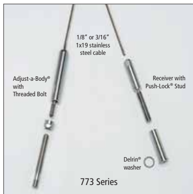
Series 773 Kits

The tensioning devices are an Adjust-a-Body® with Threaded Bolt, which threads into the metal post on one end, and a 1½" long Receiver with Push-Lock® Stud on the other end.